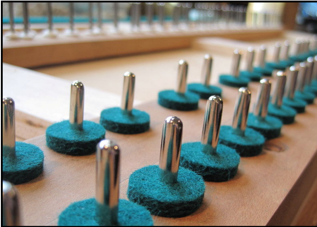
New set of keybed felts in place.

"In business to bring your piano to its full potential."