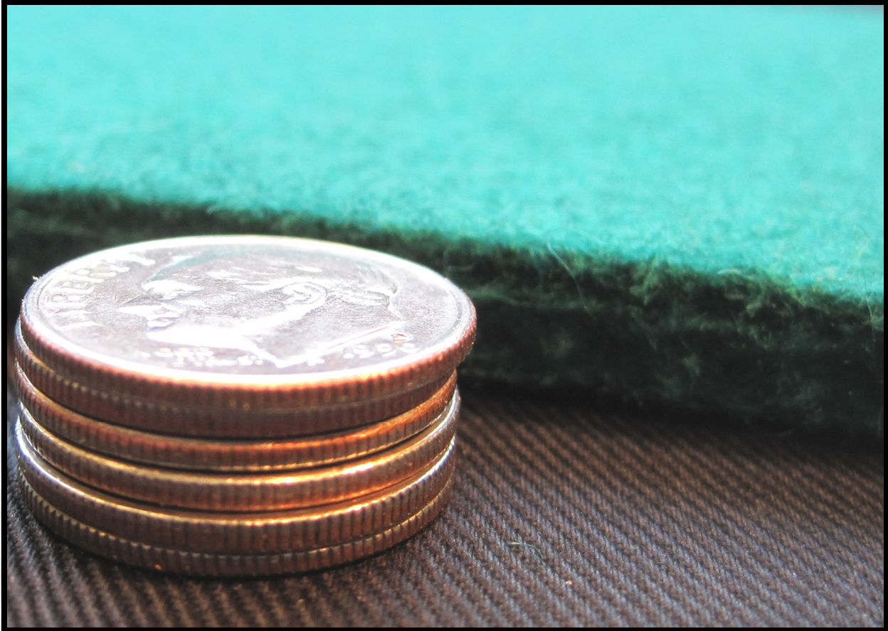
The thickness of heavy backrail cloth equals that of six dimes.