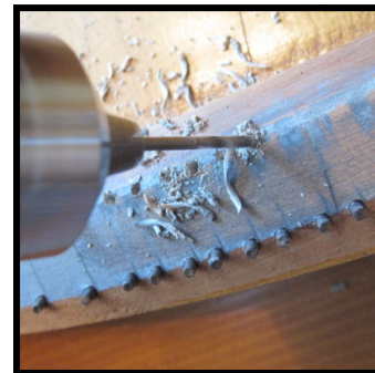
New holes are drilled.

With the bass strings temporarily removed from the bridge and bundled out of the way, the loose bridge pins will be pulled out completely so that the epoxy filler may be used. This epoxy cures rapidly as a result of the chemical reaction to the two components that are mixed together on the spot. Within a short amount of time, the hardened epoxy is ready to sand and drill for the reinsertion of the bridge pins.