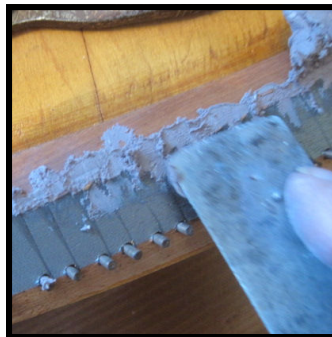
Split-out holes are filled.

Fortunately, when the splitting is not too severe, an on-the-spot remedy is often possible by the use of a heavy paste epoxy to fill in the damaged area. Oftentimes, if enough time is allowed for, this repair may be made on the same day that the piano is tuned. The bass bridge pins of your piano are loose to the point where it is affecting the tone of the piano. To make epoxy repairs to the bass bridge of your piano, extra time will need to be scheduled ahead of your tuning appointment.