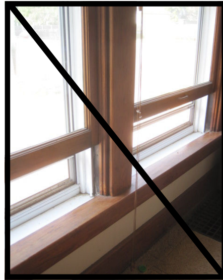
2. Drafty windows.

Note: Effective humidity control equipment, either for the home in general or the piano in particular, will aid in keeping your piano in top form.